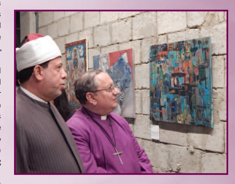
Imam from Al Azhar with Anglican Archbishop of Middle East at Cairo's The Bridge