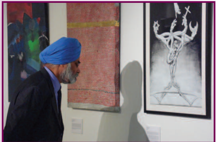
Viewing The Bridge in London

Christian, Muslim and Jewish faith backgrounds focusing on the theme of what "bridges" us to each other. The exhibition, which is sponsored by SODIC in Egypt and United Religions Initiative (URI), and will tour for 18 months, opened in Paris, France in February during the United Nations World Interfaith Harmony Week just after the Charlie Hebdo tragedy, at the historic Church of Saint-Germain-des-Prés, in the Latin Quarter, the oldest church in Paris. It has since been exhibited in Cairo, Egypt, on London's Trafalgar Square (St.Martin-in-the-Fields) and in Metz, France's majestic cathedral. Following the tour in Europe, it will head to the USA in early 2016 to open at Ground Zero's St. Paul's Chapel, following by in cities throughout the USA.