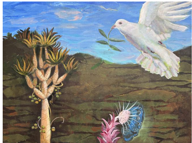
Two examples of Yona Verwer's work in NOAH: A Future Hope