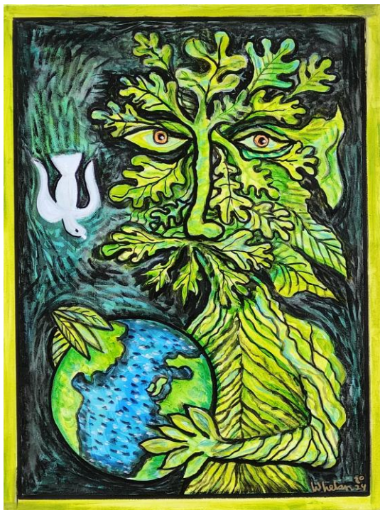
Two examples of Brian Whelan's work in NOAH: A Future Hope