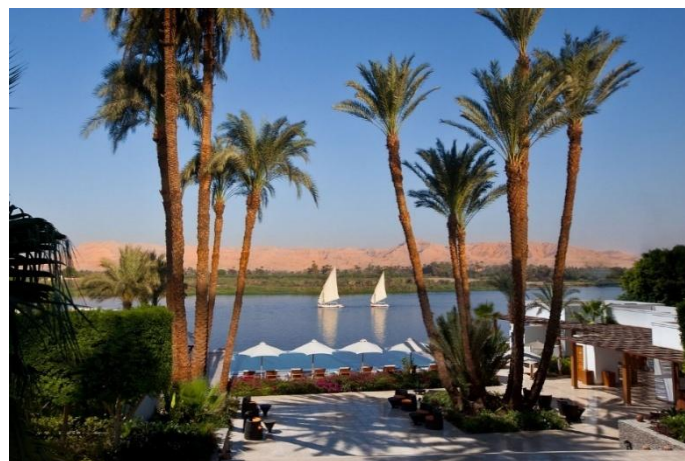
Hilton Hotel Luxor – on the Nile