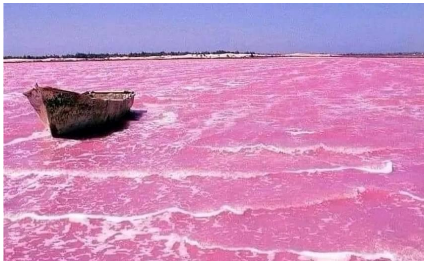
Lac Rose (Pink Lake)