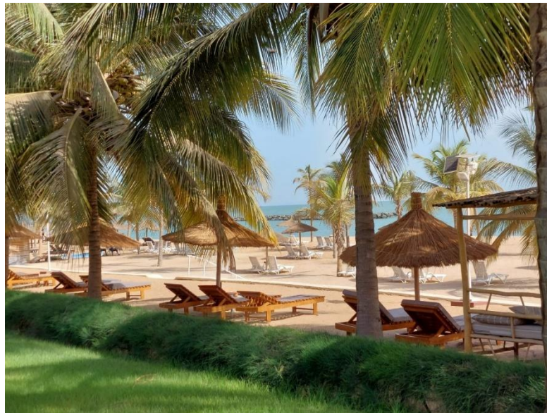
The beach at the Royam Hotel