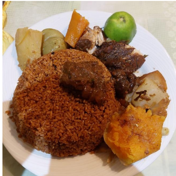
Thieboudienne, the best of Senegalese cuisine

Lunch – We will feast on the delicious Senegalese national dish of Thieboudienne at the famous Senegalese restaurant Chez Loutcha