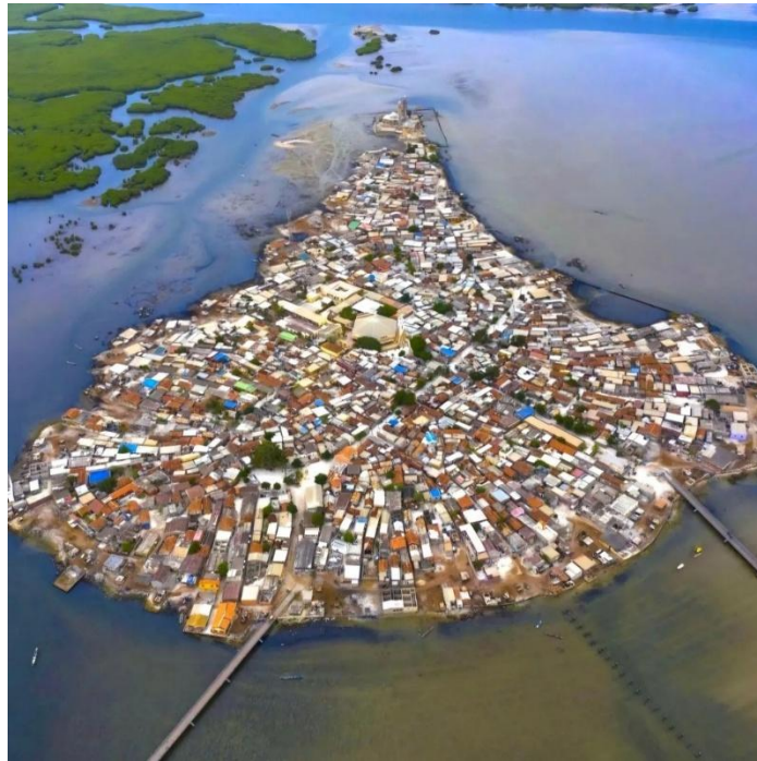
Fadiouth – “Shell Island”