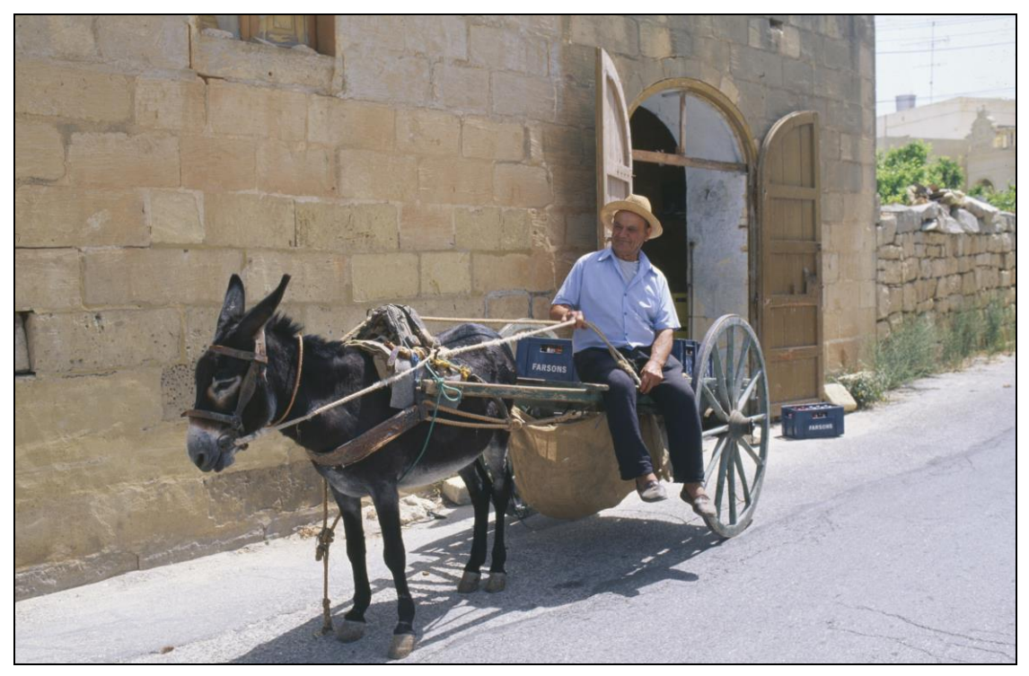
The Maltese Donkey

The form for the life-size "Maltese" fiberglass donkeys is based on the celebrated and endangered Maltese donkey, which has great symbolism. Through these Mediterranean Peace Donkeys we are attempting to focus international attention on four critical needs represented by the symbolism of the Maltese donkey.